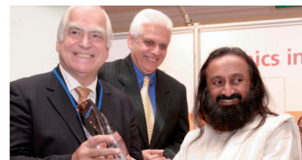
Outstanding Individual 2007 H.H. Sri Sri Ravi Shankar (right), Founder of the International Association for Human Values, presents the award to Prof. Eigen